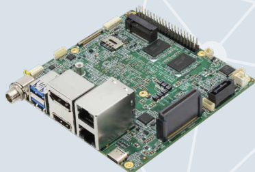
1x UP Squared 6000